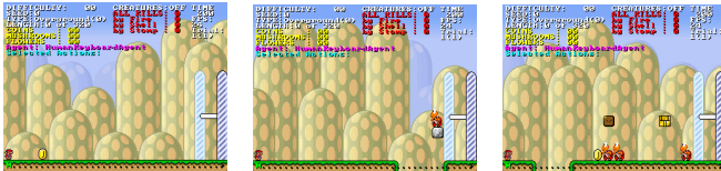
Fig. 3: Super Mario Bros scenes created with constrained MAP-Elites. Figures reproduced with permission from the authors [19].

represented as a sequence of events in the Talakat description language [18]. The algorithm tries to evolve valid scripts while making sure that the level is playable using an A* algorithm. The authors use features of the agent and the level (agent entropy, agent risk, and bullet distribution) as dimensions of the feature map. Figure 2 shows three different generated levels from this experiment from different areas in the map.