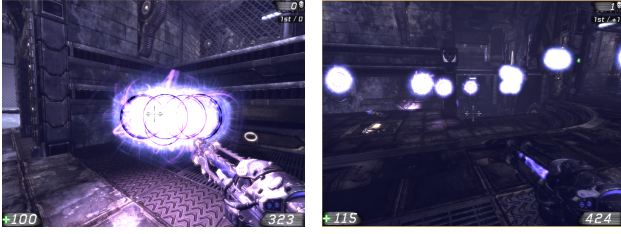
Fig. 5: Two example weapons created by constrained surprise search.

games is introduced in [17]. These weapons need to be usable and balanced but also exhibit surprising behaviors. In order to accomplish that, a constrained surprise search algorithm is devised to generate weapons that are feasible (balanced and usable) and surprising in their behaviors. In particular, two populations are employed, one where infeasible weapons are optimized towards feasibility and another population where the feasible weapons are rewarded based on their unexpectedness. Surprise is computed based on the death location of the agents used to simulate gameplay with the evolved weapons. A heatmap is computed in every generation based on the coordinates of these death locations and a prediction is made via linear regression of the heatmaps computed in the last two generations. Surprise is then computed based on the difference between the individual’s death locations and the predicted heatmap. As an example, Figure 5 shows a pair of generated weapons through this QD approach.