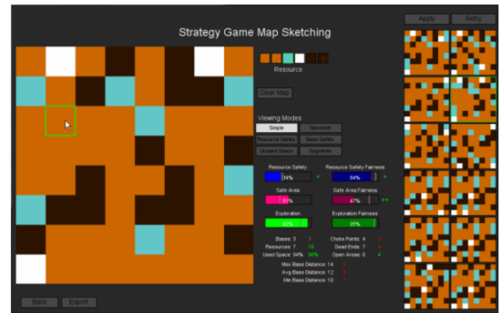
Fig. 4: A screenshot taken from the Sentient Sketchbook tool. Figure reproduced with permission from the authors [15].

MAP-Elites with Sliding Boundaries [13] was used to generate decks for the online card game Hearthstone (Blizzard, 2014). The main goal is to generate high-performing decks